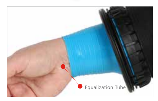
2.1 Put your hand through the seal and fit the Equalization Tube between seal and wrist. Make sure the Equalization Tube reaches all the way through the seal.