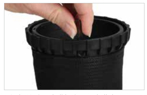
1.3 The O-ring shall be inserted all the way through, so that it is visible on both sides.