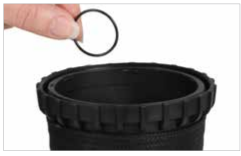
1.1 Three O-rings should be installed into each 1.2 Pinch the O-ring and insert it from the top SLÄGGÖ Flex Ring, to secure the wrist seal and of the SLÄGGÖ Flex Ring. the Glove Ring.