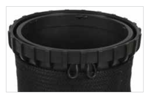
1.5 The O-ring should look like this when installed properly.