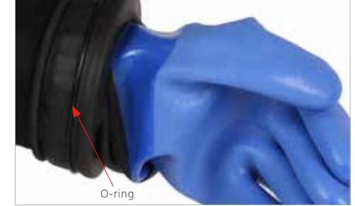
2.3 You can put an O-ring on top of the latex cuff/shaft to keep the glove securely in place.