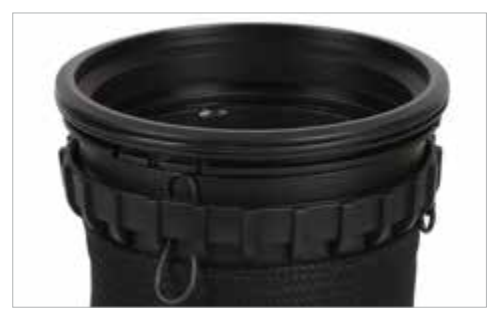
1.6 Put the NEVA Ring on top of the SLÄGGÖ Flex Ring to find out correct placement of the two remaining O-rings. Install the two remaining O-rings in the same way as the first one.