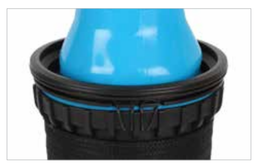
1.9 Attach the O-ring around the notches on the NEVA Ring as displayed in these two images.