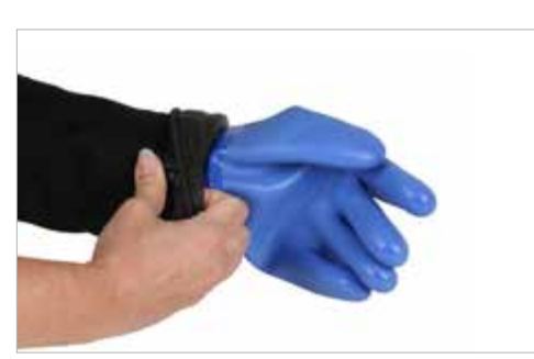
2.2 Put on the glove and pull the latex cuff/ shaft over the NEVA Ring.