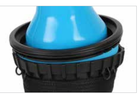
1.8 Mount the NEVA Ring and seal assembly into the top groove of the SLÄGGÖ Flex Ring.