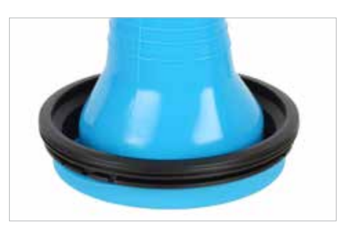
1.7 Mount the seal onto the NEVA Ring as displayed in this image. Ensure that the flange of the seal is insterted into the groove of the NEVA Ring.