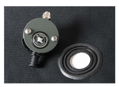
4.2 The Valve can be mounted in any SI TECH Valve Ports with large or dual guide ridge and in all Internal Valve Ports.