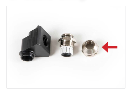
2.1 Dismantle the cable entry swivel down to three 2.2 Lubricate the cable cover with soft soap or components as shown in this picture. The arrow explains the path of the cable when installing it. Assembling of the swivel components shall be made after the cable has been installed and measured according to preferred length.