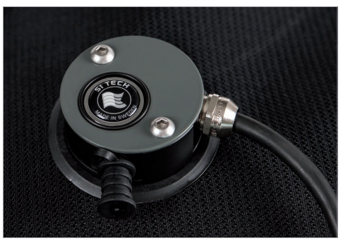
4.6 The Valve is now ready for use!