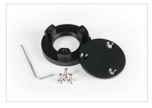
4.1 Disassemble the bottom lid by removing the screws with a 2,5 mm Allen key.