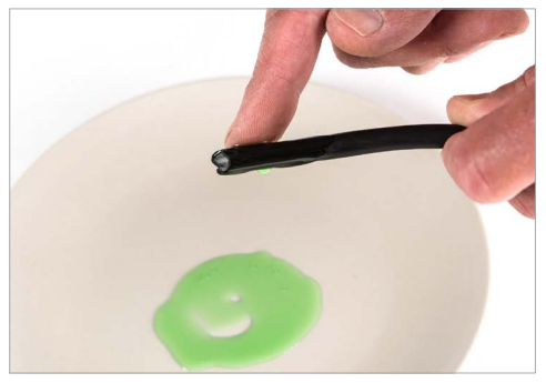
similar product. This will ease up the process of getting the cable through the cable entry components. Ensure that the cable is disconnected from eventual power sources.