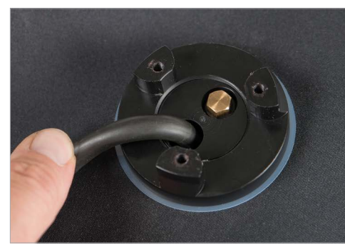
4.3 Mount the valve into the drysuit and 4.4 Bend the cable in preferred direction

Do not forget the anti-friction washer that must be located on the inside of the drysuit.