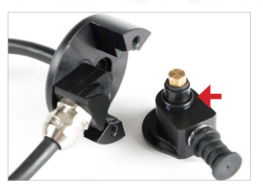
3.1 The next step is to mount the gas socket 3.2 The next step is to mount the cover lid. swivel into the valve body. Make sure that the O-ring is greased/undamaged and located as in the picture. Mount it in the same way as the cable entry swivel.