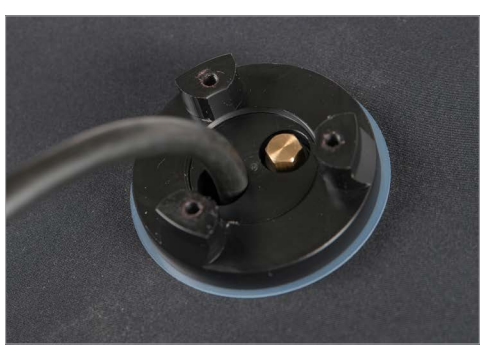
attach the body of the bottom lid. Position and mount the lid. the valve in preferred direction and tigthen it by force of hand. Tightening shall be made through rotation of the bottom lid body.

Do not forget the anti-friction washer that must be located on the inside of the drysuit.