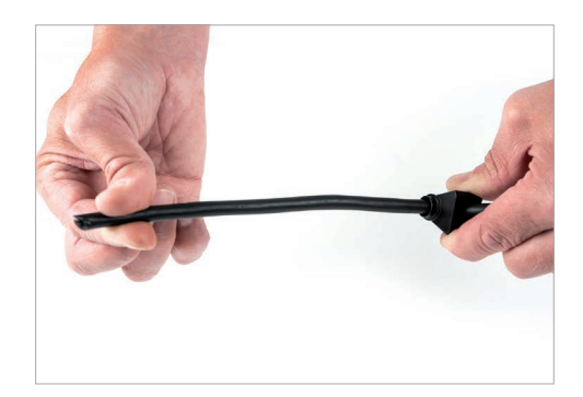
2.5 Before next step it is important to measure the length of the cable for your specific need. When the nipple is mounted and fastened it will not be possible to adjust the cable in any direction without disassembly.