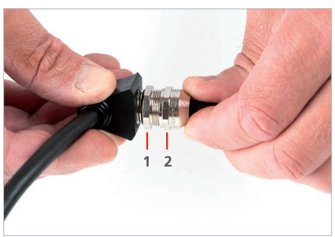
2.6 Mount the nipple into the socket by gently rotating it clockwise, be careful not to damage the thread. Tighten the nipple in two steps: